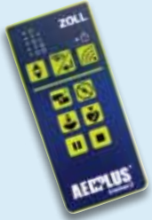
AED Plus Trainer2 Replacement Remote Part# 8008-0007