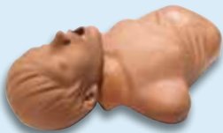
AED Plus Trainer Demo Manikin Part# 8000-0835-01