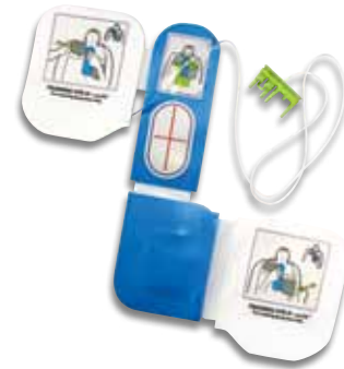
CPR-D-padz Trainer Electrodes Part# 8900-0804-01