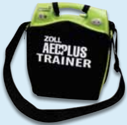
AED Plus Trainer Carry Case Part# 8000-0375-01