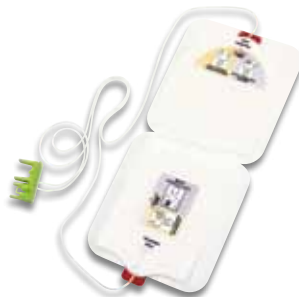
Stat-padz® II Trainer Electrodes Part# 8900-0805-01 (case of 6)