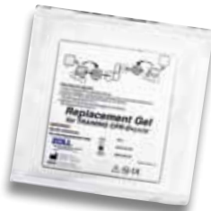
Replacement Adhesive Gels for CPR-D-padz Trainer Electrodes Part# 8900-0803-01

(Replacements must be ordered separately)