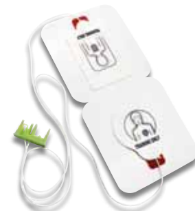
Pedi-padz® II Trainer Electrodes Part# 8900-000861-01 (case of 6)